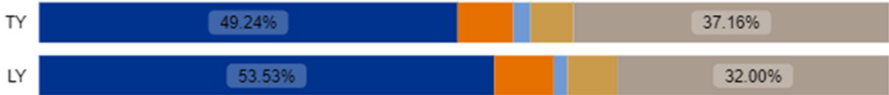
Unit Balance of Sales %