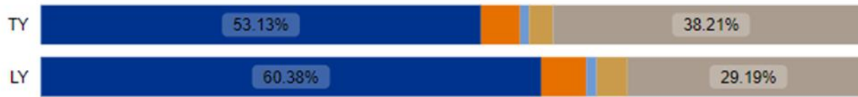
Unit Balance of Sales %